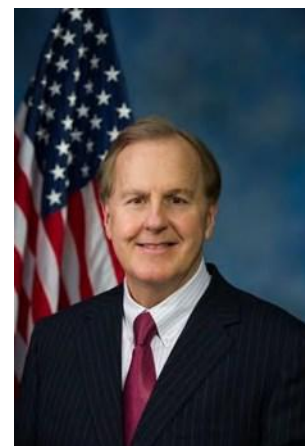
Robert Pittenger Former Congressman Chairman Parliamentary Intelligence-Security Forum