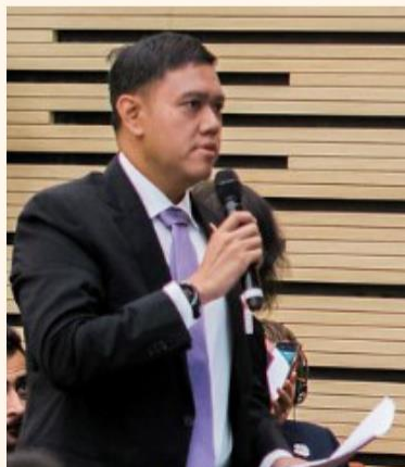
Norwegian Member of Parliament Himanshu Gulati (left) and Indonesian Member of Par-liament Dave Fikarno Laksono (right) pose a question to the panelist