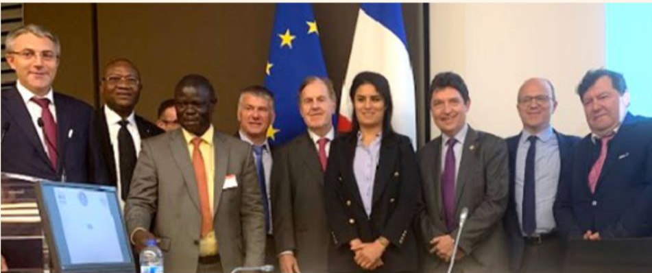
Hosts and foreign delegates that attended the forum